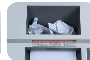
Powerful Shredding CD/DVD, ID & Credit Card