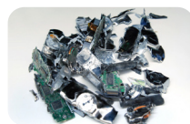
40 x random