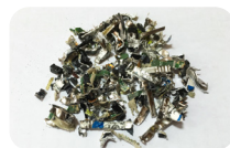
5 x random