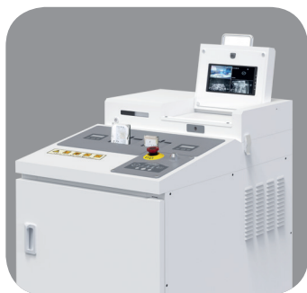
Recording System (Option)