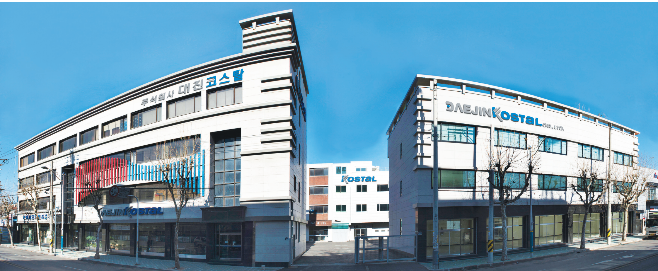
Headquarter / Factory