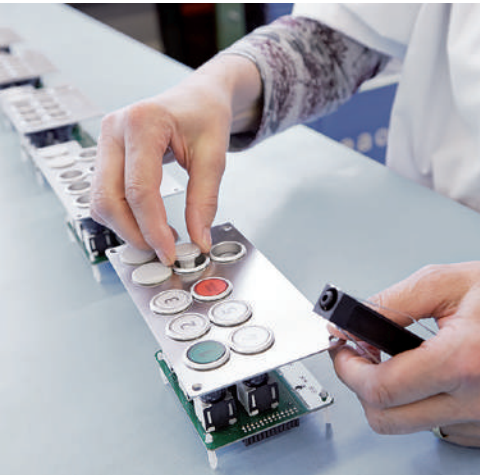
Leading-edge technology by Swiss craftsmanship