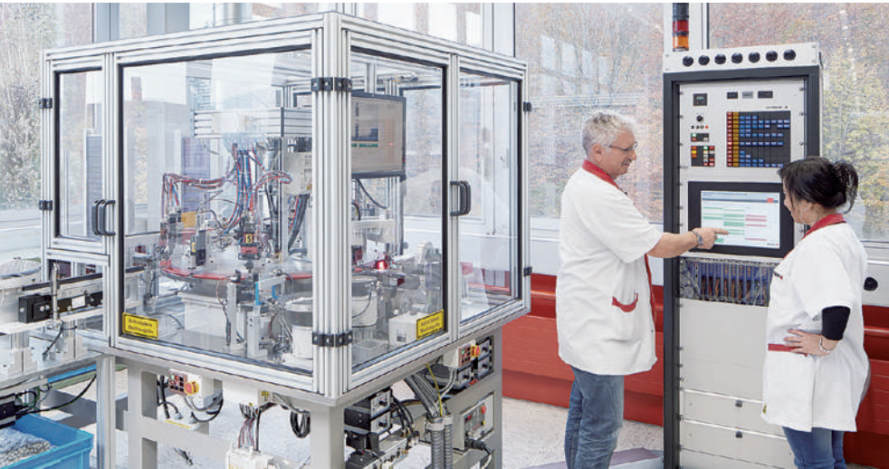
Fully automated assembly with a human touch

The individual adaptability of our components means that small as well as more major customizations can be carried out directly by EAO. We can also offer customized innovations based on standard components, with subsequent serial production. Meeting the requirements of our customers and the needs of end-users is what we do best.