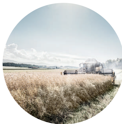
Heavy Duty & Special Vehicles

Virtually no other market combines technology, design, and safety to such a high standard as the automotive industry. Such complexity provides the sort of challenge we relish. Innovative and reliable technology paired with customer-specific functionality are what characterize our sensor-controlled, electronic, and electromechanical control elements. As a globally certified partner to major automotive manufacturers and suppliers, we impress our customers with the excellent quality of our products and services.