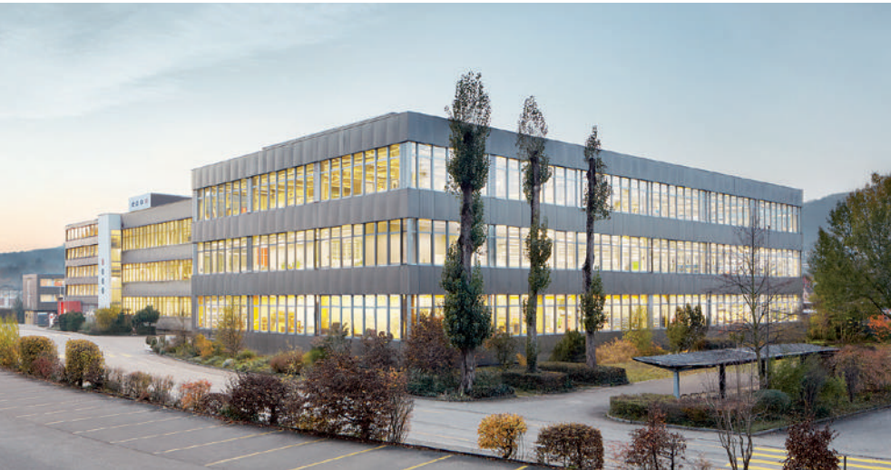
EAO Headquarters Olten, Switzerland

We act responsibly. In our ecological focus, we set benchmarks for ourselves, our products, and our customers. Our purchasing, manufacturing, and logistics operations are carried out in a manner that conserves resources and which is environmentally friendly. When selecting our components and materials, we ensure that we have partnerships in place with certified manufacturers and that we adhere to EC guidelines on hazardous materials (RoHS). We view continuous monitoring and optimization procedures at all levels as a vital part of our commitment to protecting the environment.