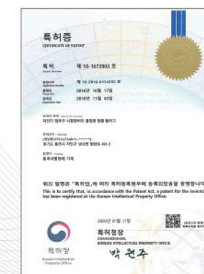
#10-1673903 (Customized clip-type plug for testing equipment for circuit breaker's contacting plates)