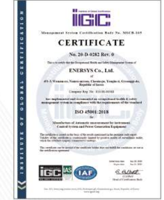
ISO 45001:2018 Certificate of safety and hygiene management system