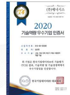
Certificate of the company with excellent technological capabilities