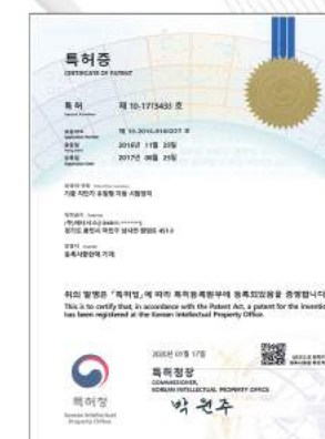
#10-1773433 (Automatic dual-type testing device for air circuit breakers)