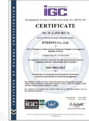
ISO 9001:2015 Certificate of product quality management system