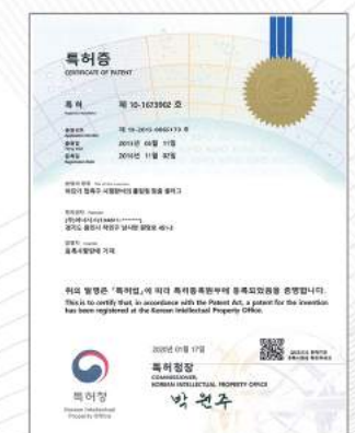
#10-1673902 (Customized clip-type plug for testing equipment for circuit breaker's contacting plates)

※ The image of the plant above was provided by Korea Hydro & Nuclear Power Co., Ltd.