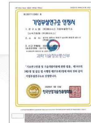
Recognition letter of Affiliated Technological Research Institute