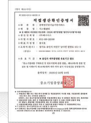
Verification of direct manufacture (system management)