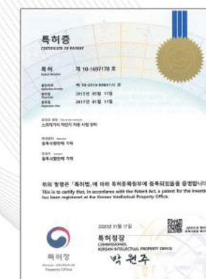
#10-1697178 (Automatic testing equipment for switchgear circuit breakers)