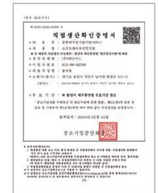
Verification of direct manufacture (software)