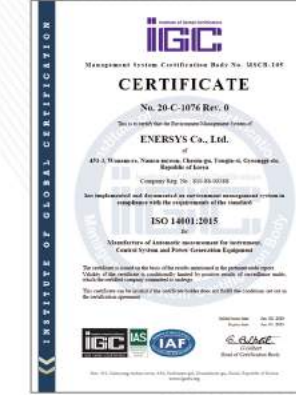
ISO 14001:2015 Certificate of the environmental management system