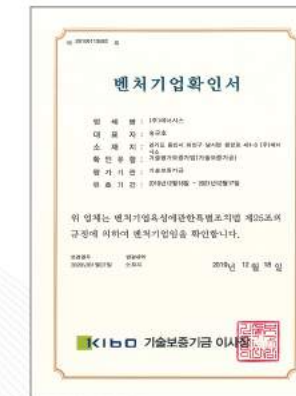
Confirmation letter for venture companies