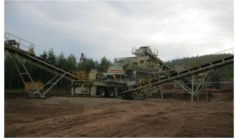
❑ 200T/HR CRUSHING PLANT (PORTABLE)