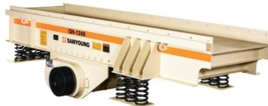
❑ VIBRATING FEEDER