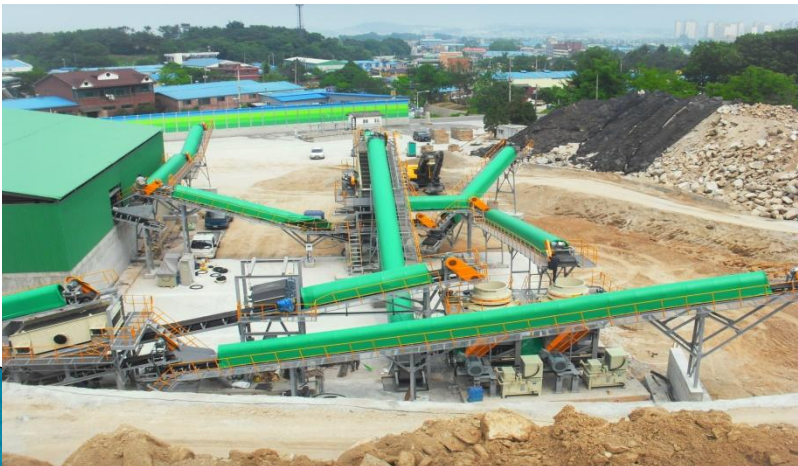
❑ 300T/HR CRUSHING PLANT