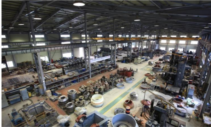
❑ MACHINING WORKSHOP