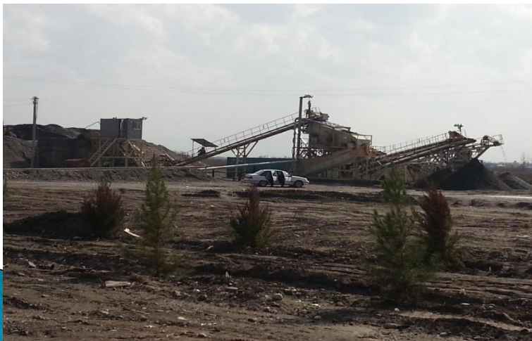
❑ 75T/HR CRUSHING & SAND PLANT