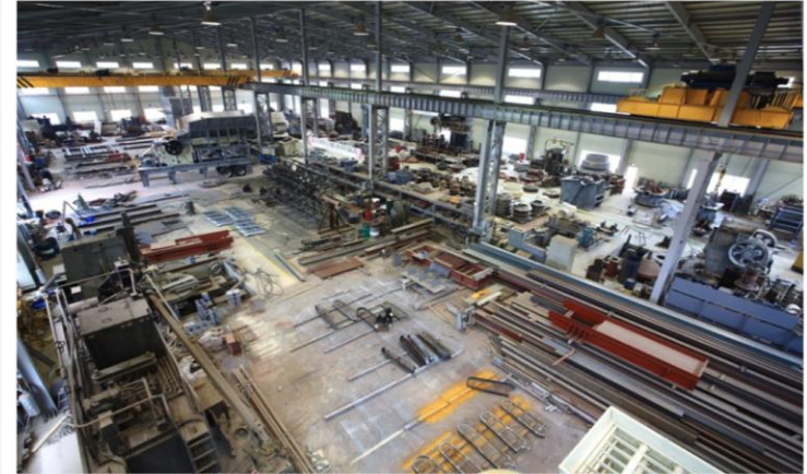
❑ FABRICATION WORKSHOP