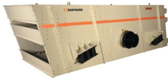
❑ VIBRATING SCREEN