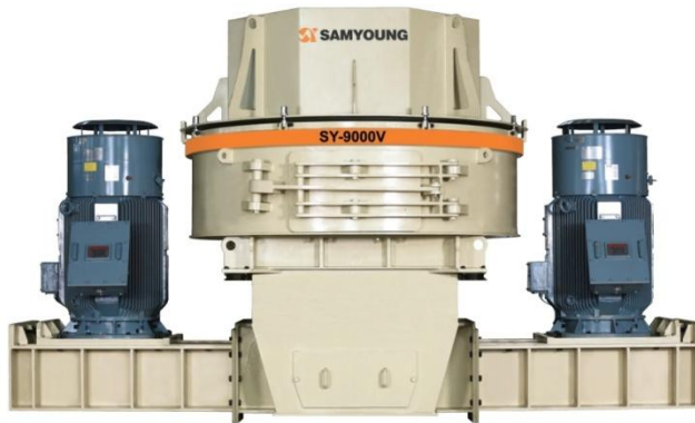
❑ VERTICAL SHAFT IMPACT CRUSHER