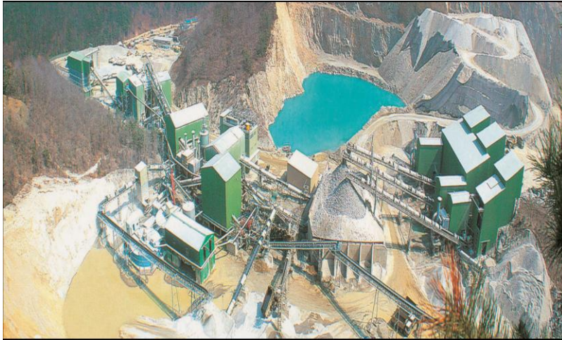
❑ 600T/HR CRUSHING PLANT