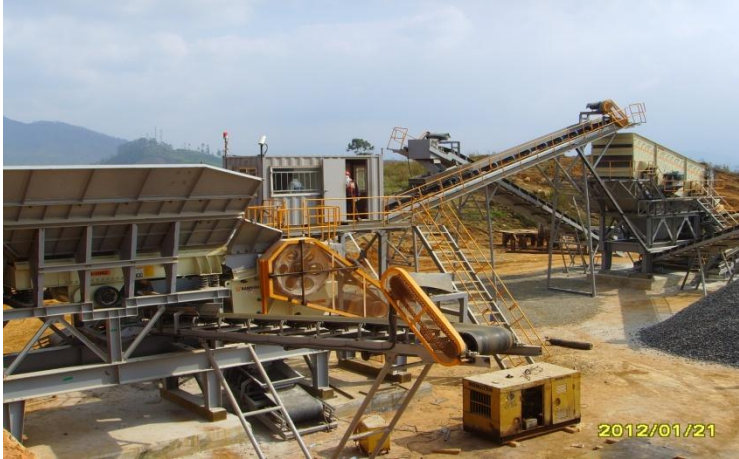
❑ 200T/HR CRUSHING PLANT (STATIONARY)