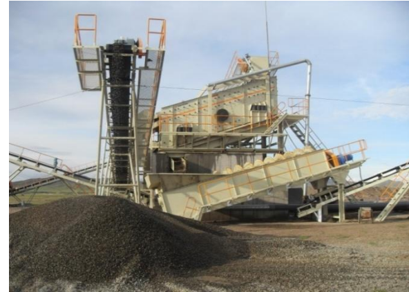
❑ SPIRAL CLASSIFIER