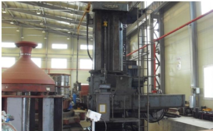
❑ HORIZONTAL BORING MACHINE (SPINDLE STROKE : 1,550mm)