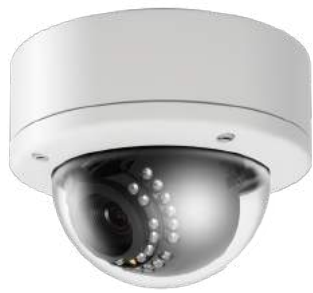
FW7502-FTF 2MP Vandal proof Dome

FW7502-FTF is a high quality Vandal proof Dome type IP camera which is equipped with 2.13MP(effective pixel) Progressive Scan CMOS image Sensor. With the highest sensitivity Starvis sensor, It is especially superior in low light condition. As it supports simultaneous H.265, H.264 and MJPEG Video Compression, less network bandwidth and storage space required. It also delivers high quality video image at 30 fps@Full HD(1920X1080) in progressive mode.