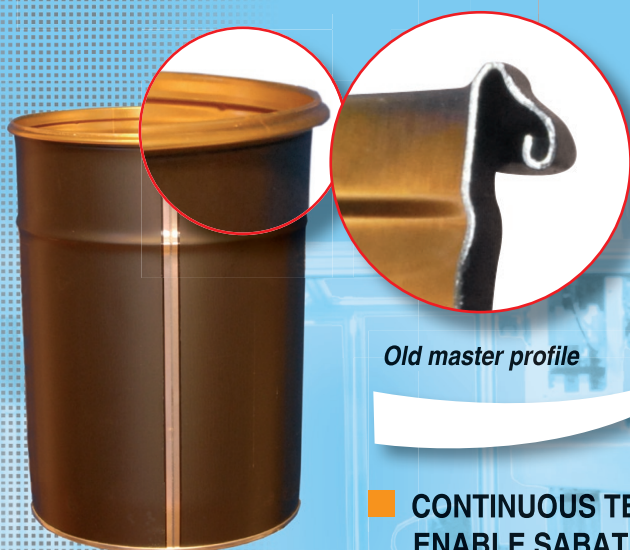
Old master profile

■ HOW TO PRODUCE PAILS WITH LATERAL OPENING FROM THE CANBODY MATERIAL?