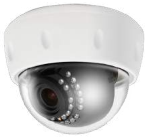
▲ FW7601-FTM 2MP Indoor Plastic Dome

FW7601-FTM is a high quality Plastic Indoor Dome type IP camera which is equipped with 2.13MP(effective pixel) Progressive Scan CMOS image Sensor. With the highest sensitivity Starvis sensor, It is especially superior in low light condition. As it supports simultaneous H.265, H.264 and MJPEG Video Compression, less network bandwidth and storage space required. It also delivers high quality video image at 30 fps@Full HD(1920X1080) in progressive mode.