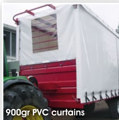
900gr PVC curtains