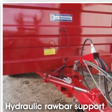
Hydraulic rawbar support