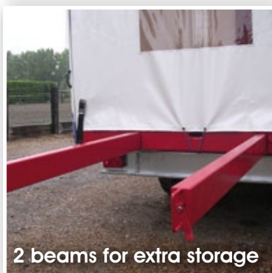
2 beams for extra storage