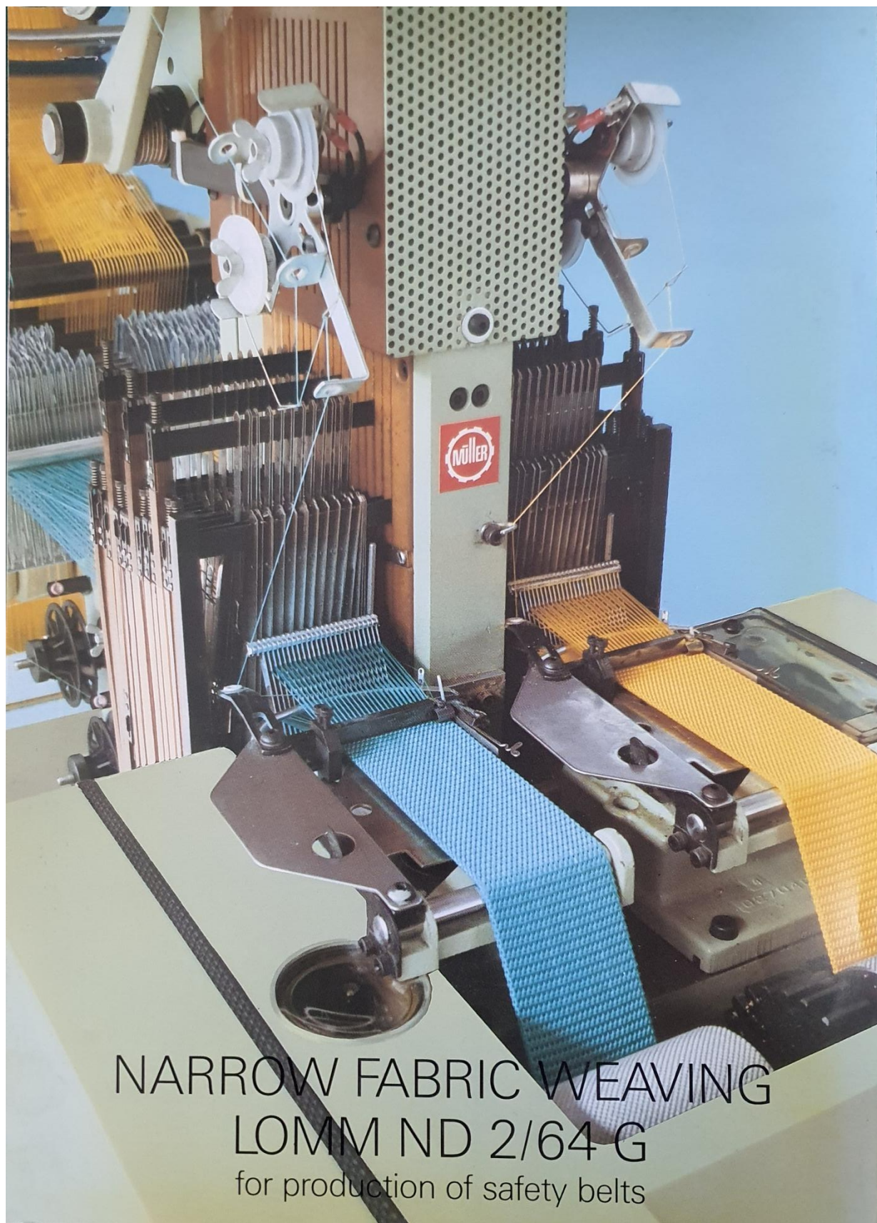
NARROW FABRIC WEAVING LOMM ND 2/64 G for production of safety belts