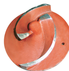
[B type impeller]

※ Type B impeller can be manufactured with "large volume wastewater pump" specification.