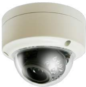
▲ FW7502-TVF 3MP Vandal proof Dome

FW7502-TVF is a high quality Vandal proof Dome type IP camera which is equipped with 3,21MP(effective pixel) Progressive Scan CMOS image Sensor. With the highest sensitivity Starvis sensor, It is especially superior in low light condition. As it supports simultaneous H.265, H.264 and MJPEG Video Compression, less network bandwidth and storage space required. It also delivers high quality video image at 30fps@3M(2048x1536) in progressive mode.