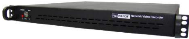
▲ FWR224-01N 32CH, Rack-mountable NVR

FWR224-01N is a 19” rack type stand-alone Network Video Recorder. Supports H,265, H,264 and MJPEG streaming from FlexWATCH cameras and others supporting ONVIF. Up to 32ch IP cameras can be registered with 480fps@2M full HD(480fps@D1) live view from video output(HDMI, VGA) and Max. 960fps@2M full HD for real-time recording up to 32 IP cameras with 4 internal SATA connection up to 32TB (4x8TB) is supported.