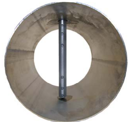
The profile of the deltaflow can even measure disturbed flow profiles with great accuracy, thanks to its multiple measuring point technology

You are thus benefiting from excellent stability in long-time use and drift-free measurement, while maintenance is kept to a minimum. This ensures that your regulating system works properly and accurately even after many years.