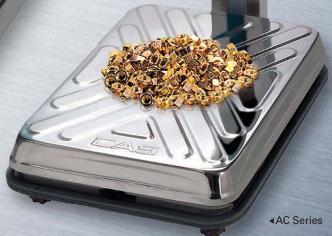
◀ AC Series