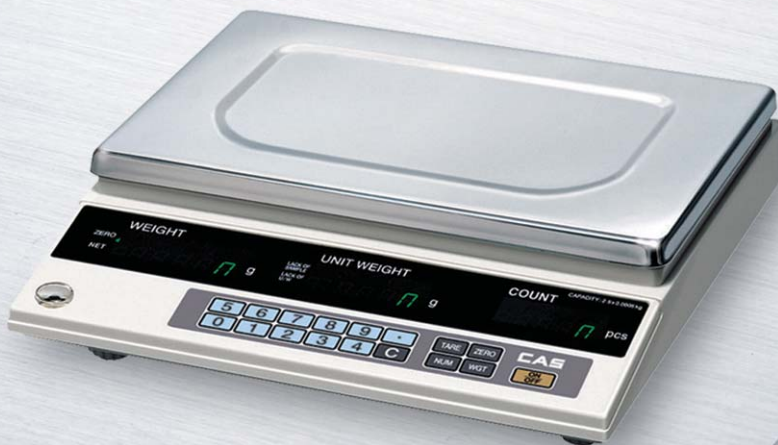
▲ CS Series