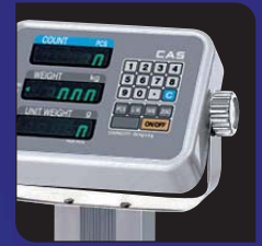
Pivot Type Indicator