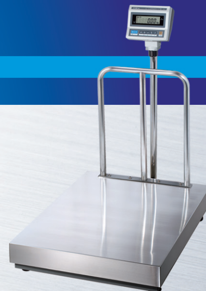
▲ ex) SPS connected with DBI indicator