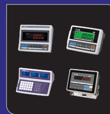
Connectivity with various CAS indicator