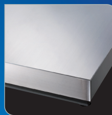
Stainless steel dust cover