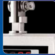
Lightweight & Robust enclosure