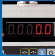
High-visibility LED display