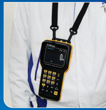
Portable handheld indicator