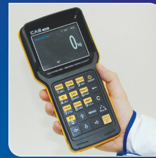
TFT LCD display