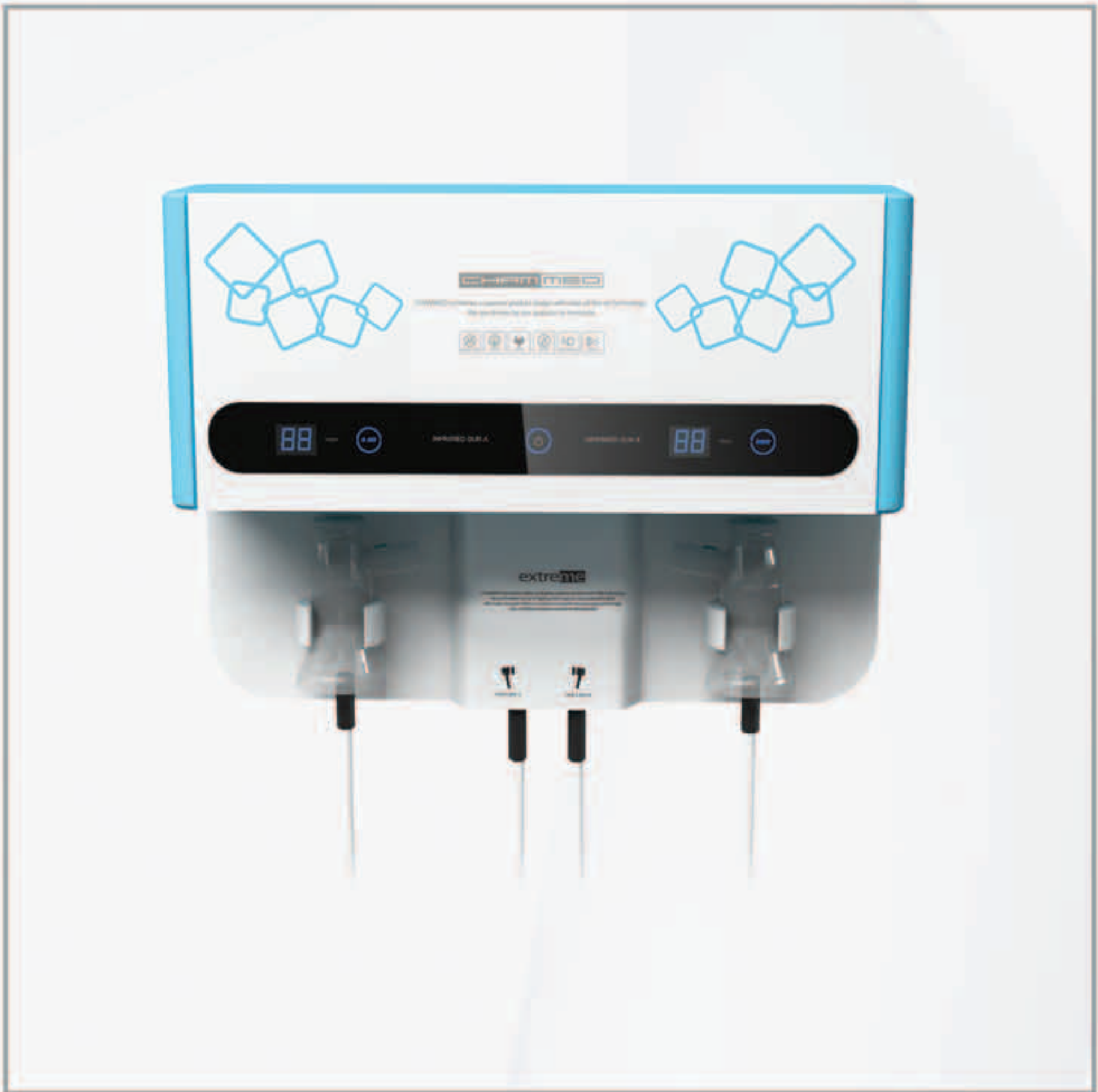
▲ XCN5 extreme