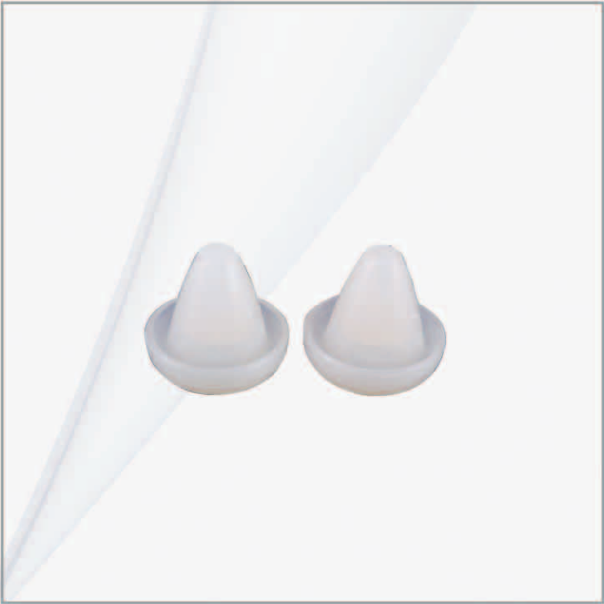
▲ Silicon tip

Head Quarter: 13hl.,A-Dong, Gunpo IT Valley, Gunpo, Korea Tel : +82-31-8068-1408/9 Fax : +82-31-8068-1430 E-mail : info@chammed.co.kr Germany Branch : Neue Grünstr. 38, 10179 Berlin, Germany Tel : +49 30 3988 9060 Fax : +49 30 8906 9767 E-mail : rich@chammed.co.kr