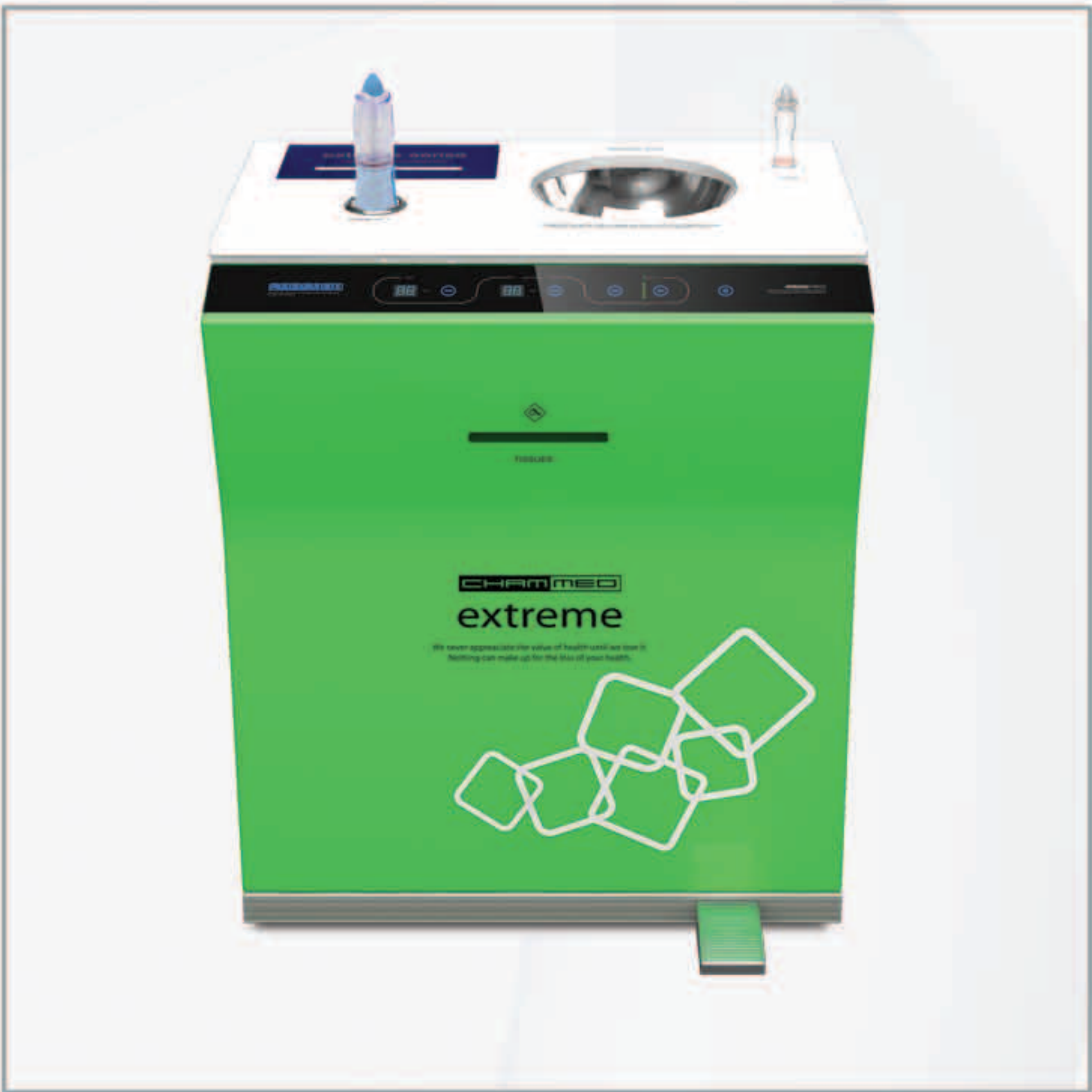
▲ XCI7 extreme