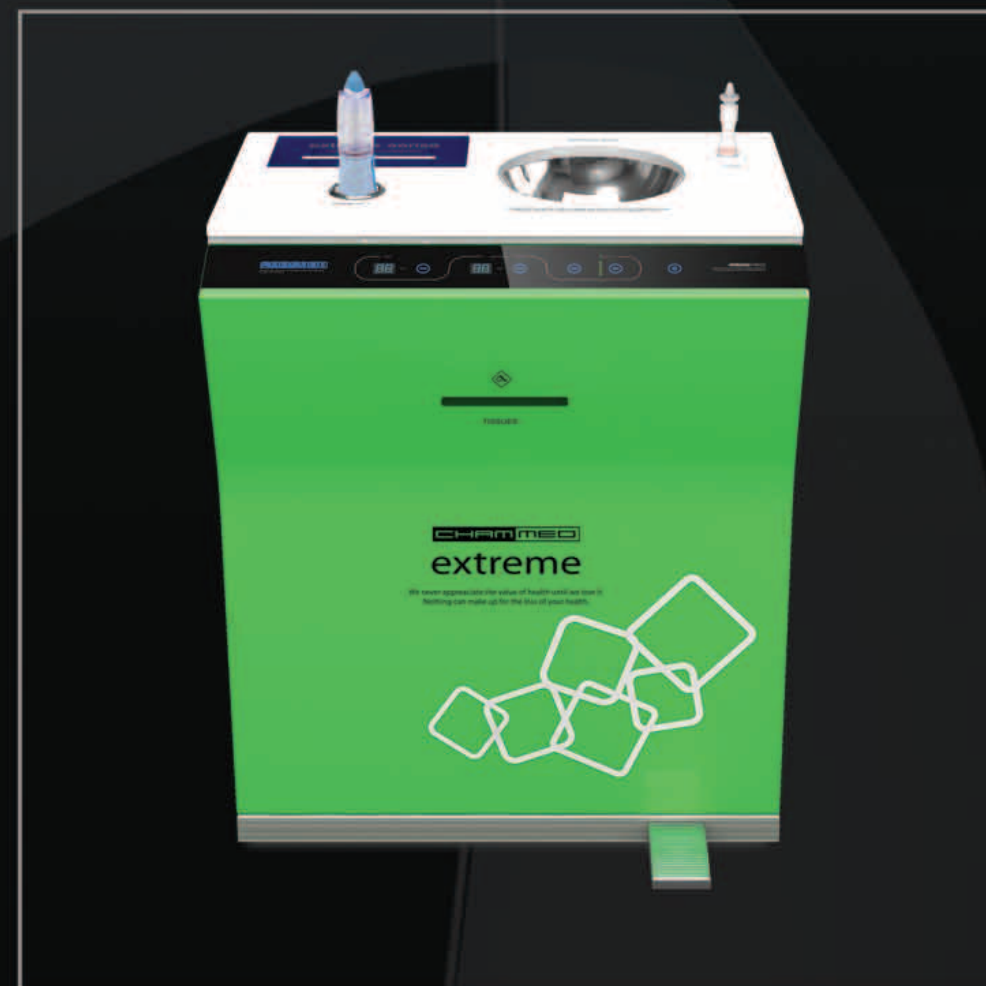
▲ XCI7 extreme