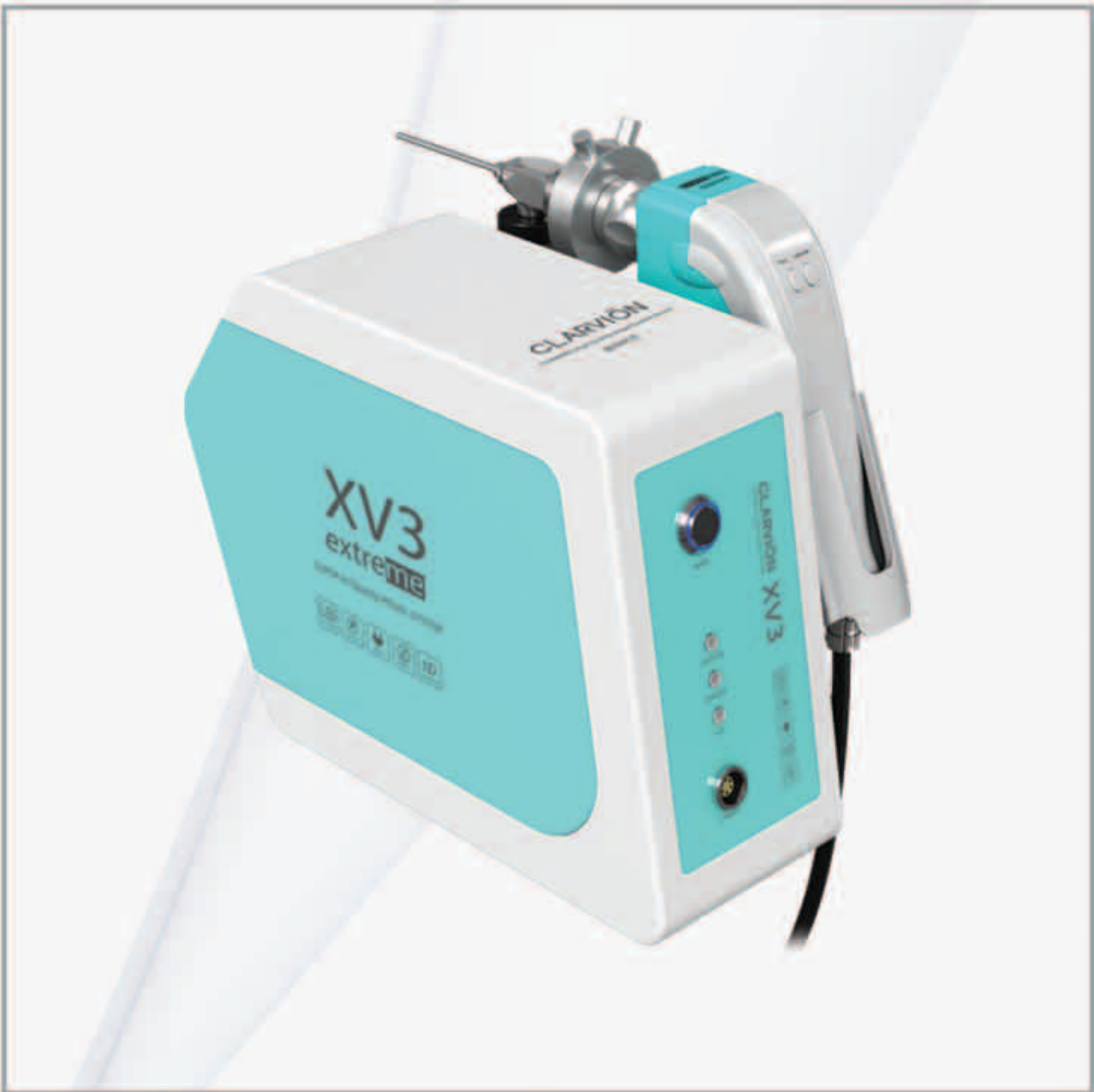
▲ XV3 MINI BlueType

Head Quarter: 13hl.,A-Dong, Gunpo IT Valley, Gunpo, Korea Tel : +82-31-8068-1408/9 Fax : +82-31-8068-1430 E-mail : info@chammed.co.kr Germany Branch : Neue Grünstr. 38, 10179 Berlin, Germany Tel : +49 30 3988 9060 Fax : +49 30 8906 9767 E-mail : rich@chammed.co.kr