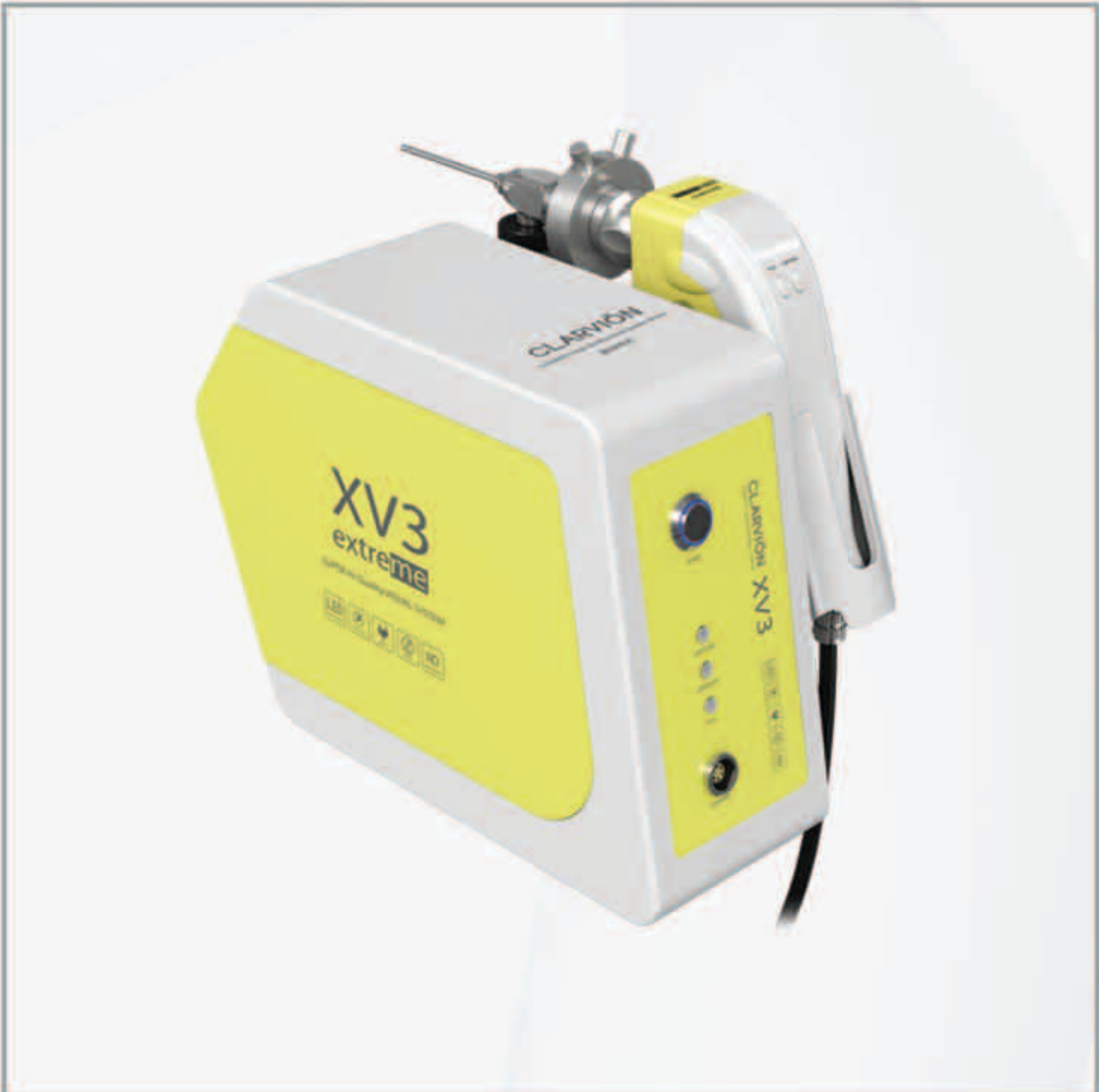
▲ XV3 MINI Yellow Type