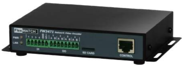
▲ FW3471 1CH, Video Server (Encoder)

FW3471 is a stand-alone 4 channel network video server to transmit the supreme video and audio data over the TCP/IP network. FW3471 supports simultaneous H,264 and MJPEG Video Compression, less network bandwidth and storage space required, FW3471 delivers High Video quality at maximum 30 fps in different resolution. Traditionally, the analog video signal from the analog camera causes a “tearing” effect due to the fact even and odd fields are slightly displaced with time interval. FW3471 converts the interlaced image from conventional analog camera into a progressive quality image, FW3471 makes it possible to monitor fast moving images in vivid and crystal clear quality.