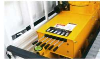
Outtrigger operation levers

Convenient to carry out automatically horizontal & vertical control by using operating levers installed on both sides of the equipment. Valve can be safely protected by using separate cover and appearance is elegantly furnished in modern type.