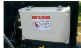
Overthrow preventive system

Bucket can be manually bended to suit user's operation type, which makes it possible to do inner clean-up. it assures safe operation by being automatically tilted when up & down.