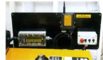
Remote control system

Sensor perceives vehicle-overthrow without delay. Users promptly recognize it by buzzer-typed watch-light. Being secure by stoping its operation beyond safety range in case of overthrow-warning.