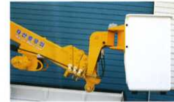
Automatic bucket Tilting system

Raises heavy weight of 900kgf at high speed. it guarantees safe operation by the installation of wet-corrosion automatic brakes.