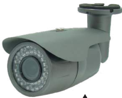
FW7901-PVM 5MP Motorized Bullet

FW7901-PVM is a high quality Bullet type IP camera which is equipped with 6.82MP(effective pixel) Progressive Scan CMOS image Sensor. With the highest sensitivity Starvis sensor, It is especially superior in low light condition. As it supports simultaneous H.265, H.264 and MJPEG Video Compression, less network bandwidth and storage space required. It also delivers high quality video image at 15fps@5M(2592x1944) or 30fps@4M(2688x1520) in progressive mode.