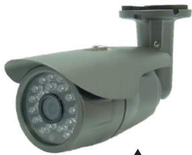
FW7902-PVF 5MP Fixed Bullet

FW7902-PVF is a high quality Bullet type IP camera which is equipped with 6.82MP(effective pixel) Progressive Scan CMOS image Sensor. With the highest sensitivity Starvis sensor, It is especially superior in low light condition. As it supports simultaneous H.265, H.264 and MJPEG Video Compression, less network bandwidth and storage space required. It also delivers high quality video image at 15fps@5M(2592x1944) or 30fps@4M(2688x1520) in progressive mode.