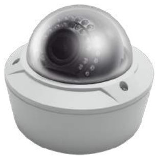
FW7501-FTM 2MP Vandal proof Dome

FW7501-FTM is a high quality Vandal proof Dome type IP camera which is equipped with 2.13MP(effective pixel) Progressive Scan CMOS image Sensor. With the highest sensitivity Starvis sensor, It is especially superior in low light condition. As it supports simultaneous H.265, H.264 and MJPEG Video Compression, less network bandwidth and storage space required. It also delivers high quality video image at 30 fps@Full HD(1920X1080) in progressive mode.