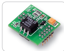
RS-485 Communication Module