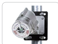
U-Bolt/Pole Mount 2" ~ 3" Pipe mounting