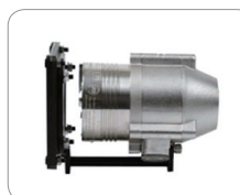
Duct Mount In high temperatures