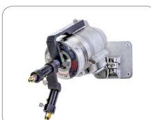
Laser Pointer Optimizing detector location