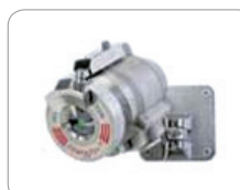
Air shield Using under tough environmental conditions