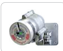
Tilt Mount Wall Mount bracket