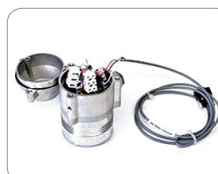
USB RS485 Harness Re-configure settings or perform diagnostics