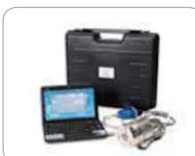
Mini Laptop Kit Re-configure settings or perform diagnostics