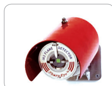
Weather Protector Protecting the detector from rain and snow