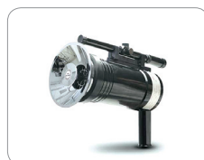
Simulators Up to 9m