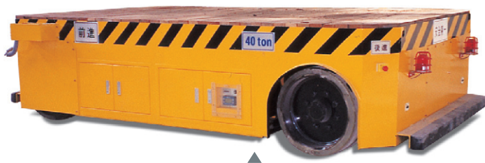
▲ MANUFACTURED AND DELIVERED TO HYUNDAI MOTOR COMPANY (BEIJING, CHINA) 40 TON CAPACITY OF TRACKLESS ELECTRIC TRANSPORTATION CAR