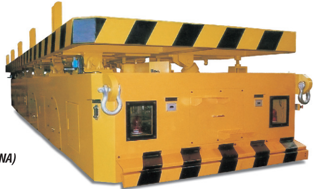
▲ MANUFACTURED AND DELIVERED TO POSCO 60 TON CAPACITY OF TRANSPORTER CAR FOR WIDE WIDTH OF STEEL PLATE