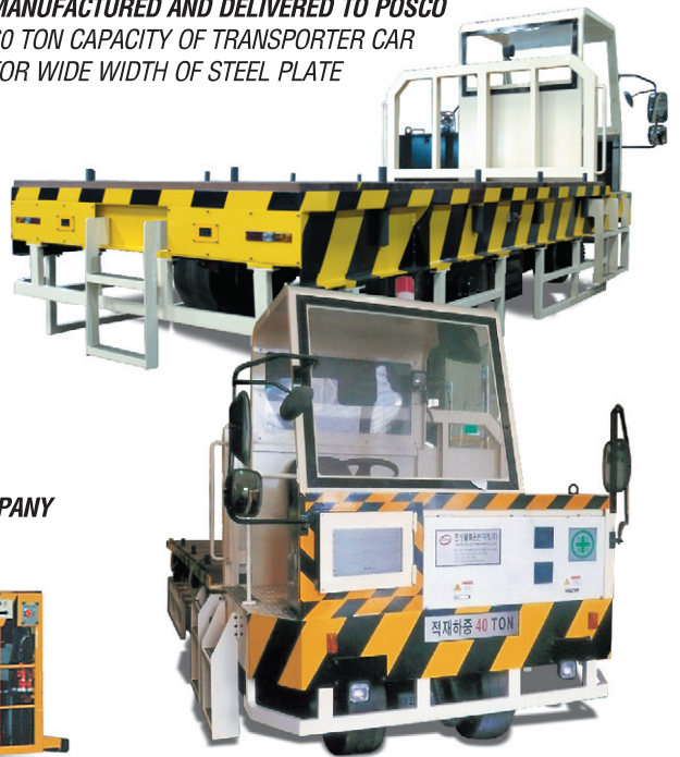
▲ MANUFACTURED AND DELIVERED TO GM DAEWOO 40 TON CAPACITY OF ELECTRIC TRUCK WITH CABIN