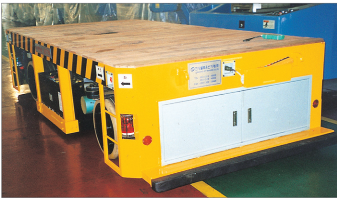
▲ MANUFACTURED AND DELIVERED TO ULSAN FACTORY OF HYUNDAI MOTOR COMPANY 25 TON CAPACITY OF TRACKLESS ELECTRIC TRANSPORTER CAR ▼