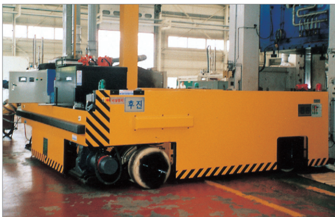
▲ MANUFACTURED AND DELIVERED TO BUGANG FACTORY OF HANWHA CHEMICAL-20TON CAPACITY OF TRACKLESS ELECTRIC TRANSPORTER CAR ▲ EASY IN AND OUT OF MOLD IN PRESS MACHINE BY ATTACHING ENTRY/EXIT DEVICE OF MOLD AND HEIGHT ADJUSTMENT DEVICE