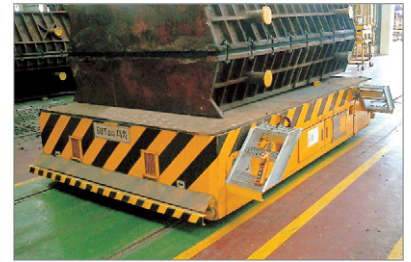
MANUFACTURED AND DELIVERED TO HHI ▶