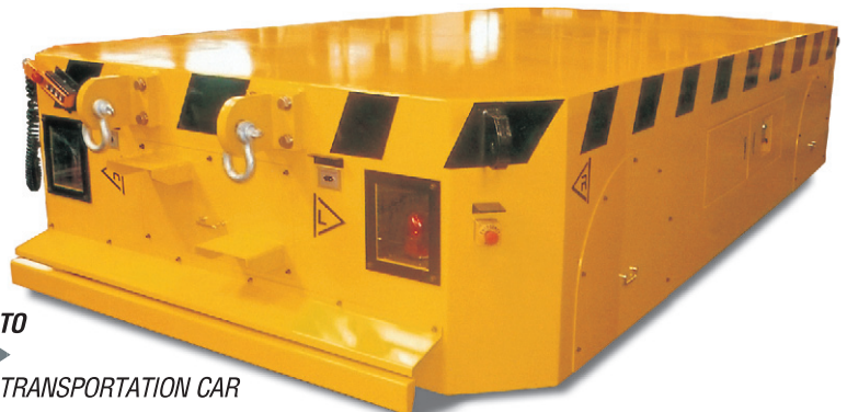
MANUFACTURED AND DELIVERED TO FORD MOTOR COMPANY (INDIA) ▶ 50 TON CAPACITY OF TRACKLESS TRANSPORTATION CAR