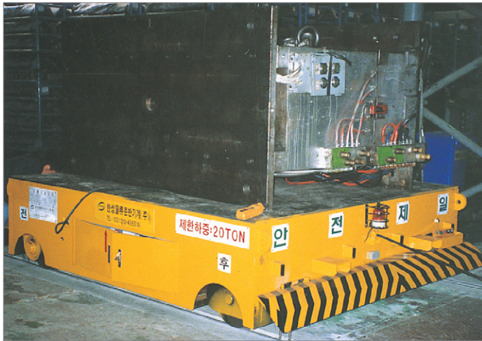
▲ MANUFACTURED AND DELIVERED TO APPOLO IND.