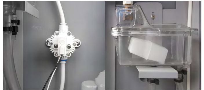
Automatic system from water supply to ice production

Superior device and screws produce highly purified flake type ice as hard particles.