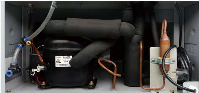
High performance freezing system

Superior device and screws produce highly purified flake type ice as hard particles.