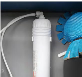
High standard purification filter

Ice amount is controlled by sensor for protecting from over-production.