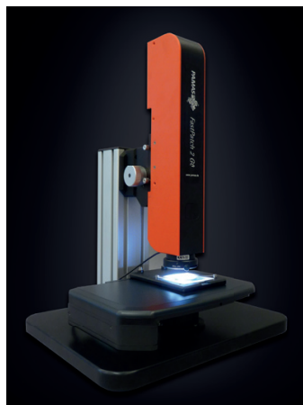
The LED ringlight provides incidental uniform white illumination to the entire membrane filter patch.