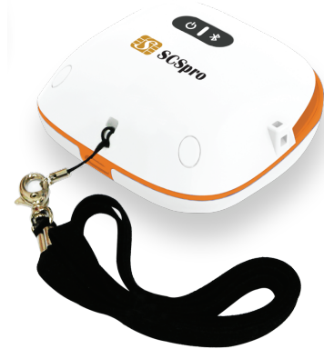
With the strap