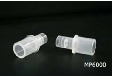
M.O.Q. 50pcs per order

*Over 1Kpcs order's case, we will provide buyer designed gift box and logo imprinted without extra charge.