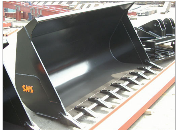
SR (Straight Lip Rock) BUCKET