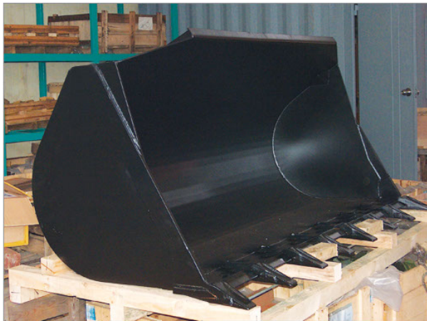
GP (General Purpose) BUCKET