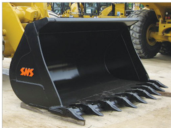
VR(V-shape Lip Rock) BUCKET