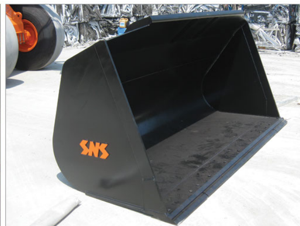
LM(Light Material) BUCKET