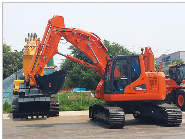
SRF for DX235LCR