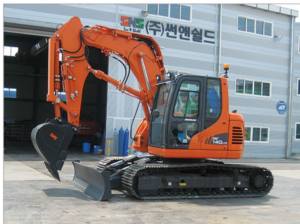
SRF for DX140LCR