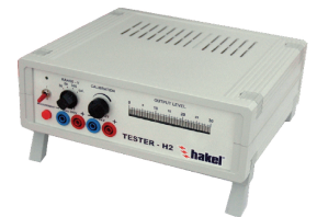
▲ TESTER H2