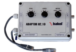
▲ ADAPTOR H2.10