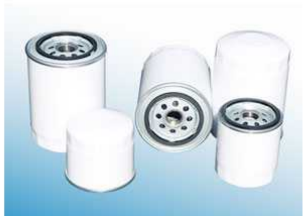
FINISHED SEAMING PHOTO